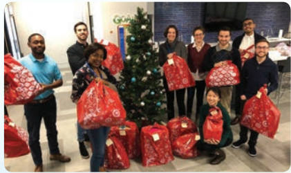
Acumen Solutions employees gave gifts to 52 children in our Holiday Program!

For the families we serve who are working hard to pay the rent and put food on the table, the thought of finding funds to buy gifts for their children at the holidays or school supplies in the fall is extremely stressful.