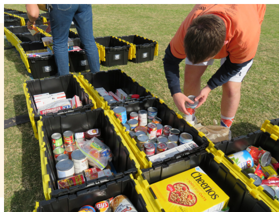
Left: Food donations are placed in the outer perimeter of the Art for the Sky design at the 2016 event. Right: The Burke-Fairfax VA Chapter of Jack and Jill of America was one of 47 teams that participated in the 2016 event.