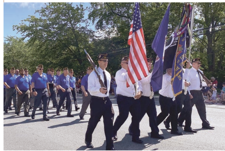
Veterans of Foreign Wars Post 8469 presents the flags of Veterans of Foreign Wars and POW/MIA.

do this after the year that we've had. It's nice to see everybody getting back out, celebrating our freedom and being together."