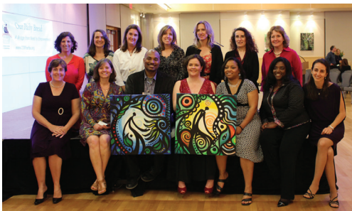
In 2014, Our Daily Bread celebrated 30 years of service to the Fairfax community. ODB's 30 th Anniversary celebration, "Do You See What I See?" in association with Fairfax Spotlight on the Arts, featured an art show and music, poetry and dance performances by artists in our community.